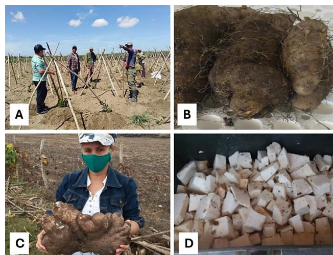
Figure 2. Production technology transfer results of the categorized yam seeds in Jiguaní Municipality, Cuba, through a triple helix (TH) model (university-productive government-sector). The results are presented in four sections: (A) Awareness-raising and training activities for producers through advice; (B) Quantitative variables of yam yield and quality; (C) Yield of 8 kg/plant -1 with seeds from in vitro plants; and (D) Obtaining certified seeds with a survival rate of at least 98% and greater capacity to adapt to soil and climatic conditions.

of 68% was observed with innovation compared to 4% through the traditional route. Quality doubled (2.12 times) when the innovation was used compared to the control, while the highest variable performance value increase due to innovation (12%) was recorded compared to the control (0.2%). Finally, the highest value of the variable performance increase was recorded in innovation (14) compared to control (2) (Table 2).